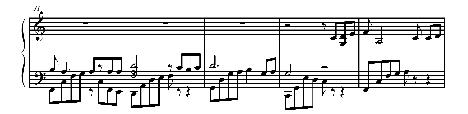
Brightly Beam 2 of 6